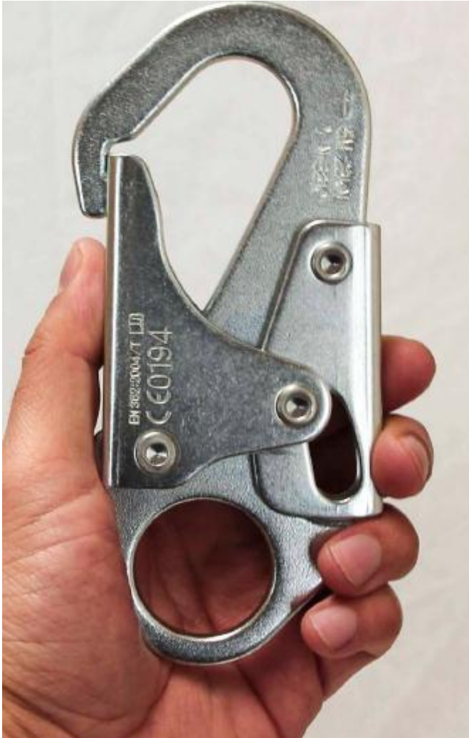
Figure 5: Picture of hook with “tail” of rivets exposed