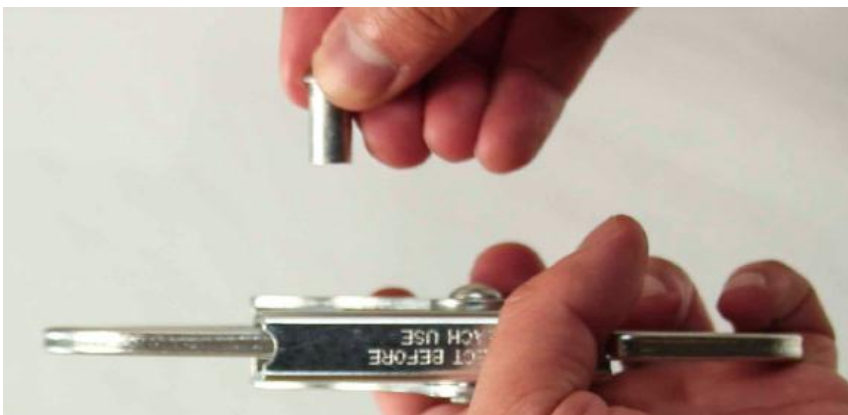
Figure 7: Fully removed rivet